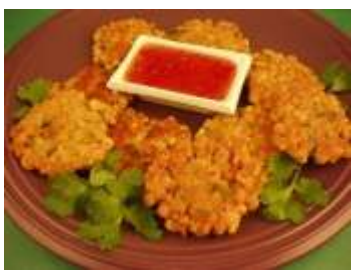
Try our Sweet Red Chili Sauce for dipping