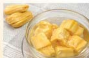
Jackfruit in syrup