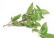
Sweet basil (horapba)