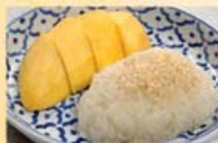
Sticky rice with ripe mango