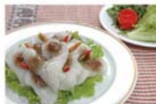
Khao Kriab Pak Mub