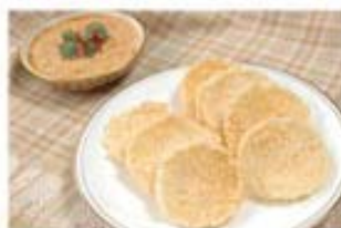
Khao Tang Nua Tang

There are also various recipes of the Thai food recommended, for instance: