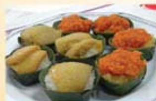
Sticky rice with toppings