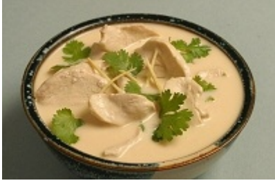
The Favorite Thai Soup